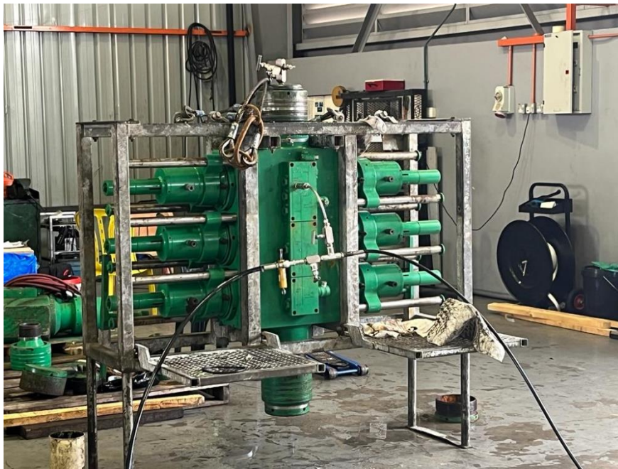
Pressure Test Body BOP